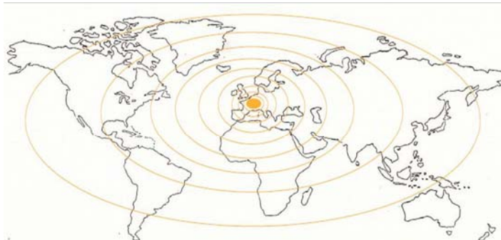
A EUROPEAN FORUM - WITH A GLOBAL MESSAGE